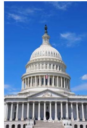
Office of Inspector General